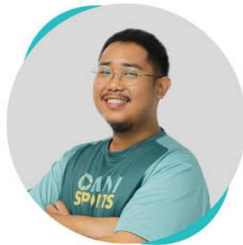
Coach Mus Head Coach