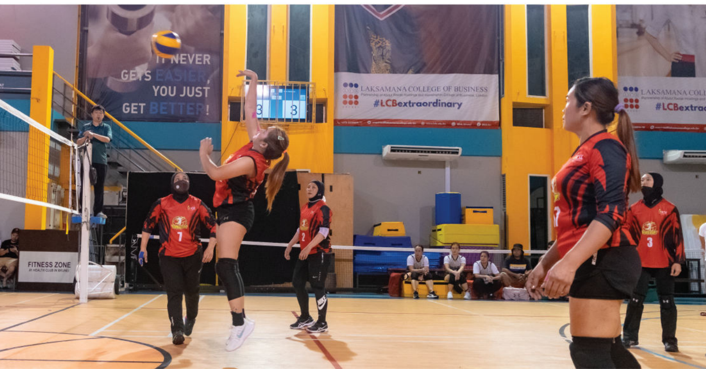
Tournament women's volleyball league