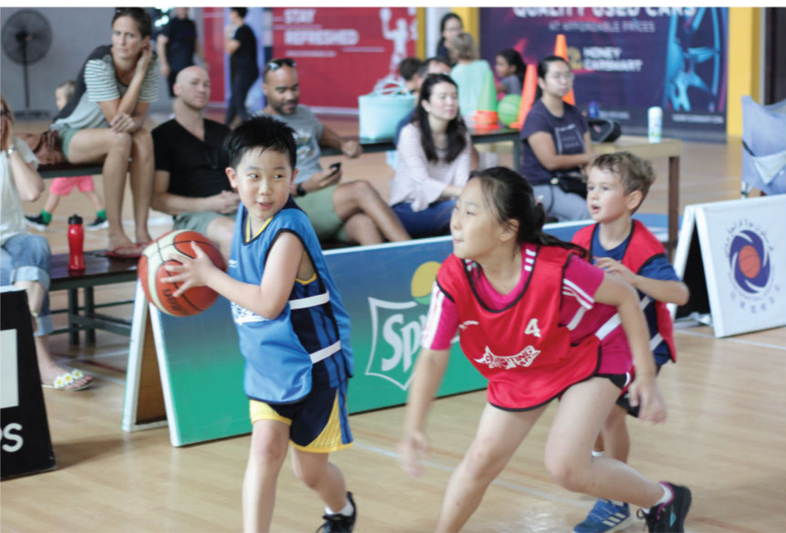
Mini Event basketball fun day