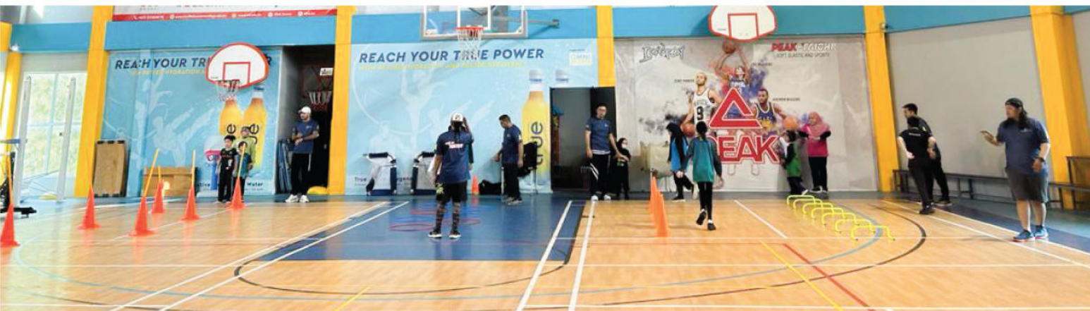
Facility fitness zone, mph