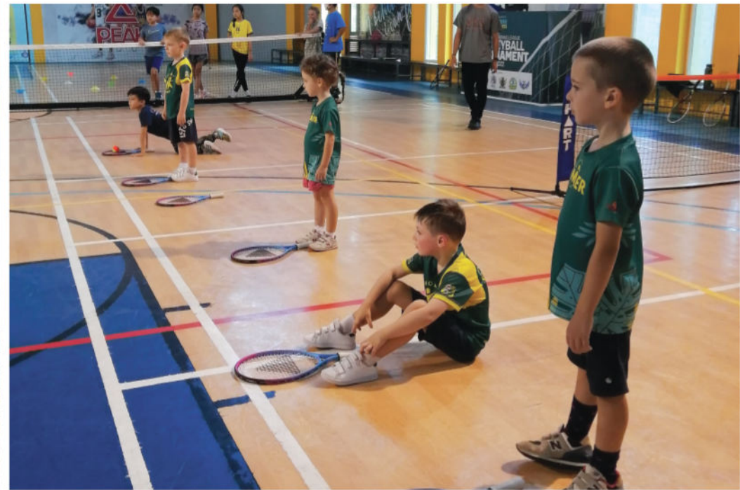
School Holiday Camp fitness zone, mph