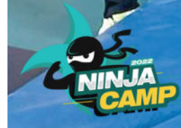
Ninja Camp fitness zone, mph